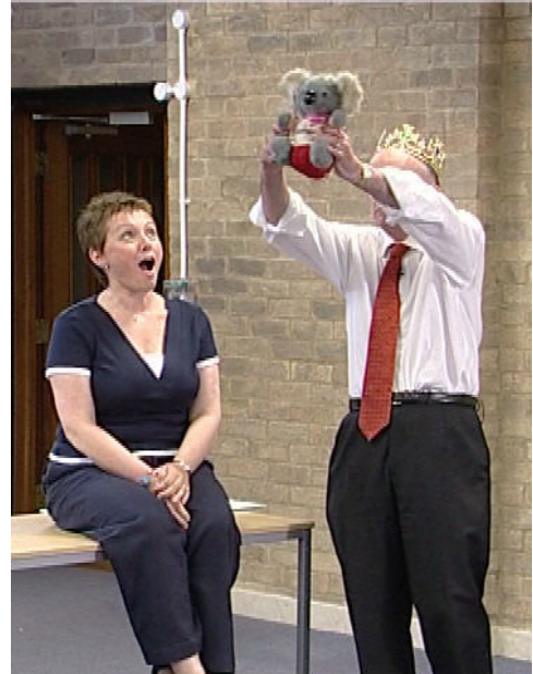
The bear gets it again!

By e-transfer (BACS/CHAPS): send your name, address to ian@thinkinghistory.co.uk and we will e-mail back with bank details.